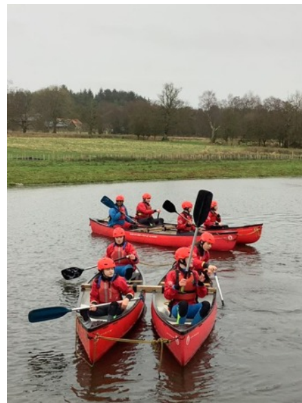
Pictured above: The Year 9 Peat Rigg students

Since the start of 2024 lots of outdoor education has been happening. From the Year 9 leadership and futures residential to the DofE programme, students have been developing their leadership in the great outdoors. In January 105 students from Year 9 took part in our first leadership and futures residential. The trip began with a challenging 10km walk through mud and ice to our destination, Peat Rigg Outdoor Centre in Cropton Forest. Throughout the 3 days our students took part in lots of exciting outdoor activities, designed to develop their leadership skills. From canoeing on a semi frozen lake to completing challenging team activities, it was excellent to see our students rise to the challenge. Fueled by plenty of hearty food, the students walked home on day 3, exhausted, but ready for their next adventure! Year 9 students are now looking forward to starting the Bronze DofE at the end of year 9. For more information on DofE, please visit www.edofe.org