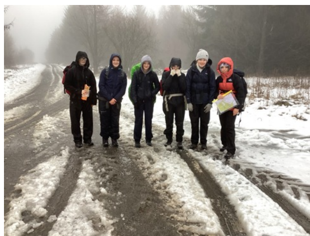
Pictured: The Bronze students in the snow in Dalby Forest

Just before half-term, over 50 of our motivated and resilient Year 10 students headed up into the North York Moors to complete their Bronze DofE practice expedition. Starting at Thornton Dale, students navigated up to the high plateau of Dalby Forest, encountering driving snow and heavy winds. Supported by staff, they developed their navigational skills and gained respect for the natural environment. Students spent the night at Birch Hall scout camp, cooking their own meals before heading walking back home the following day. Well done to all involved and we hope that your June qualifying expedition will be a little bit warmer!