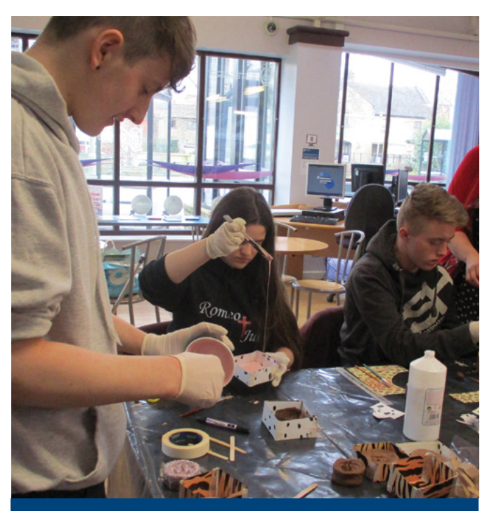
A community art project with Pickering Library working with an artist in residence