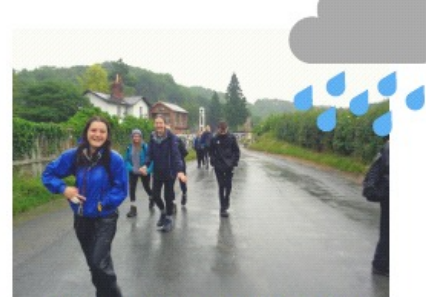
Still smiling, despite the rain.