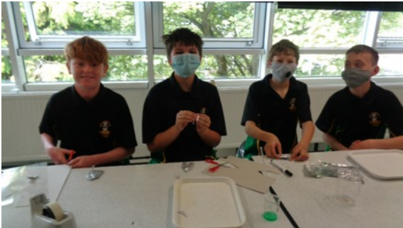
Year 7 students making their washing up liquid powered boats.